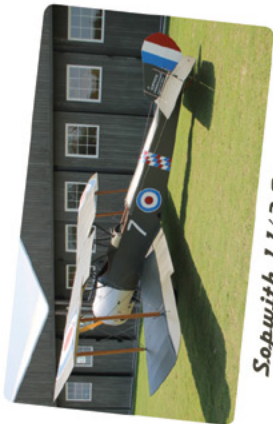
Sopwith 1 1/2 Strutter

On the Cover: The Roma dirigible was built in Italy for the US Army. On February 21, 1922, it took off from Langley Field for a local test flight and crashed in Norfolk killing 34 crew members.